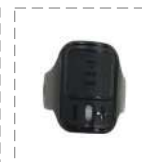
Wireless Ring PTT