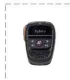
Wireless Remote Speaker Microphone