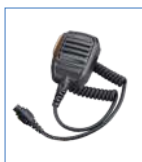
Wired Remote Speaker Microphone